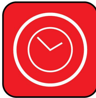
CONTROL SIGN (RED)