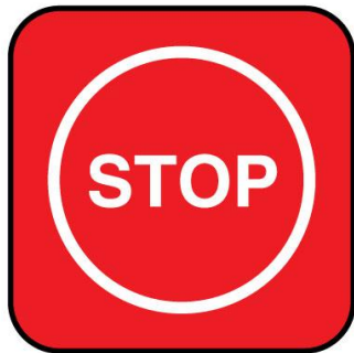
STOP SIGN (RED)