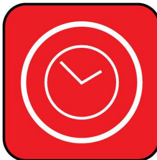
CONTROL SIGN (RED)