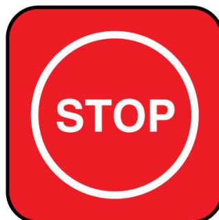
STOP SIGN (RED)