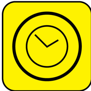
PRE SIGN (YELLOW)