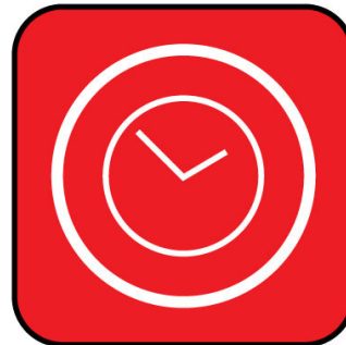
CONTROL SIGN (RED)